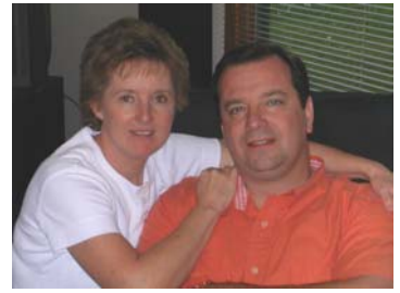
Editor with Sweetie Pie "50 ain't old"

My words here will bring nods of approval by some, and will produce negative reactions in others. Yet, if even one family is spared the damage that public school will do to their children, then publicly admitting my awful decision is well worth the humiliation.